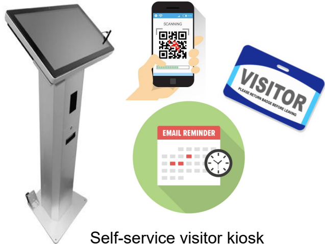
Self-service visitor kiosk